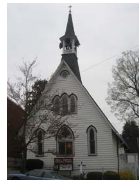
Holy Trinity, Brookville