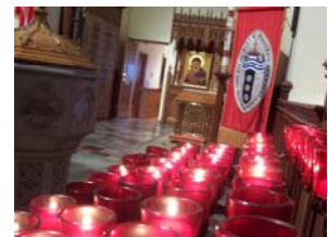
Cathedral of St. Paul, Erie