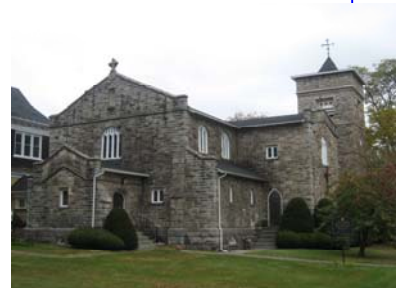
St. Luke's, Smethport