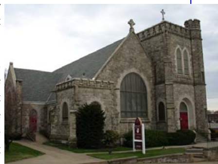
Trinity Church, New Castle

Diocesan Convention will be held on November 6-7 at The Villa in New Castle, PA, and is being hosted by Trinity Church, New Castle.