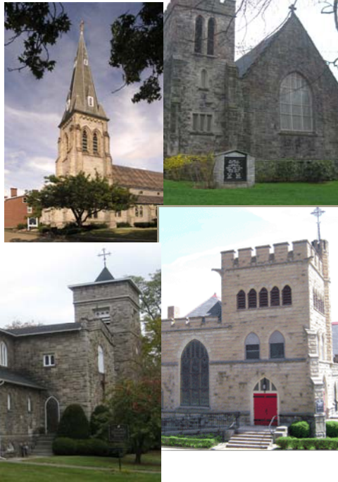
Spiritual Gifts workshops will be held in October at (clockwise starting at the top left): the Cathedral of St. Paul, Erie; Grace, Ridgway; St. John's, Sharon; and St. Luke's, Smethport.